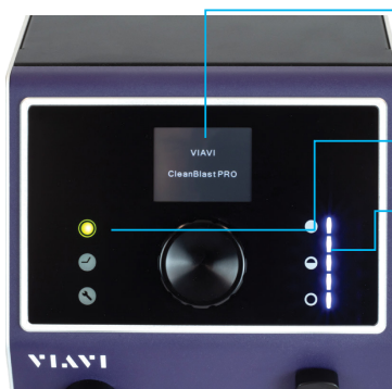
Figure 3: Front panel indicators and controls

The CleanBlastPRO controls are intuitive so that users can easily manage their cleaning profiles and receive information and notifications to ensure system care. With multiple on-board sensors, CleanBlastPRO actively monitors the system performance, ensuring that users are proactively informed of any maintenance needs, and can properly care for the system and plan ahead without guesswork, speculation or unwanted production line downtime.