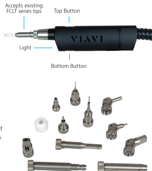
Figure 2: Examples of FCLT Series Cleaning Tips

Contact the professionals at Fiber Optic Center for a quote or to get more details.