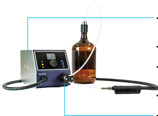
Figure 4: Solvent refill