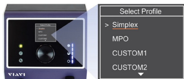
Figure 1a: Select Profile