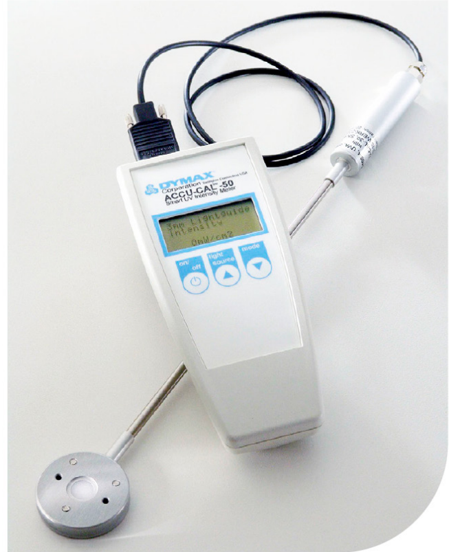
ACCU-CAL™ 50 for measuring floods and conveyors only PN 39561

Contact the professionals at Fiber Optic Center for a quote or to get more details.