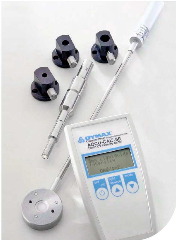
ACCU-CAL™ 50 for measuring spots, floods, and conveyors PN 39560

▶ Click here for more details on the Dymax ACCU-CAL 50 Radiometer Flood to Spot Adapter Kit