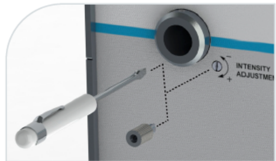
Intensity Adjustment Options

The unit includes an intensity adjustment knob for fingertip adjustment or the adjustment can be performed with a flat-head screwdriver when the knob is removed.