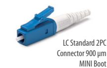
LC Standard 2PC Connector 900 µm MINI Boot