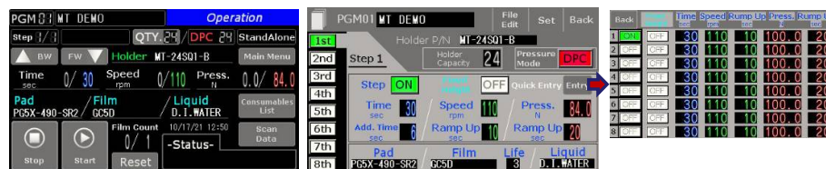
Interface of A3C model consumables info input & control