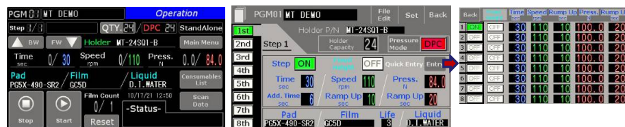
Interface of A3C model consumables info input & control