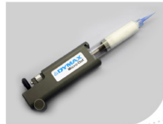
Thumb Activated Micro-Dot Syringe Dispenser (T20000)

Contact the professionals at Fiber Optic Center for a quote or to get more details.