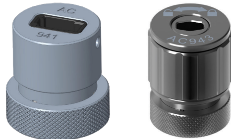
AC941: Patchcord testing MMC Adaptor

AC Detector Adaptors enable testing with the MAP series Optical Power Meters, Insertion Loss/Return Loss Meters and Swept Wavelength system.