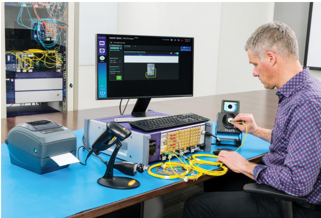
MAP-380 with PCT Test System

The PCT Test Solution consists of a powerful family of modules, software and peripherals for testing IL, RL, physical length, and polarity.